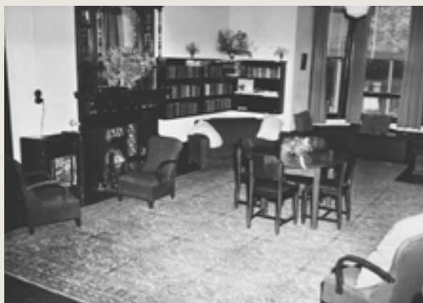
Allambi Girls Hostel, Sitting Room undated GRG 29/139