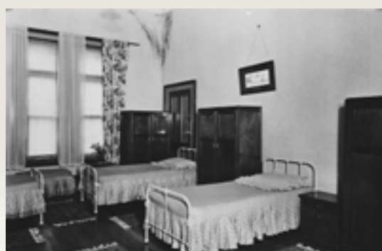
Vaughan House 1947, Vaughan House 1953, Dormitory 1947 GRG 29/139