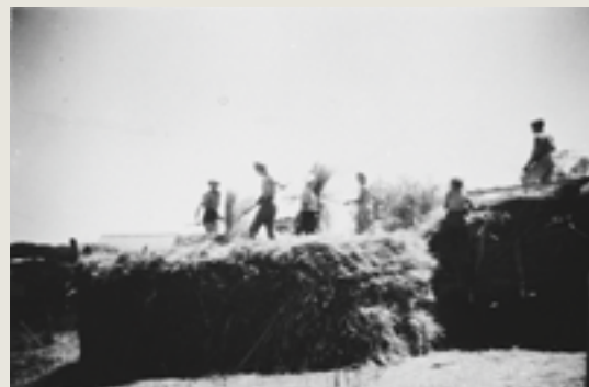
Lochiel Park Boys Training Centre, boys at work GRG 29/139