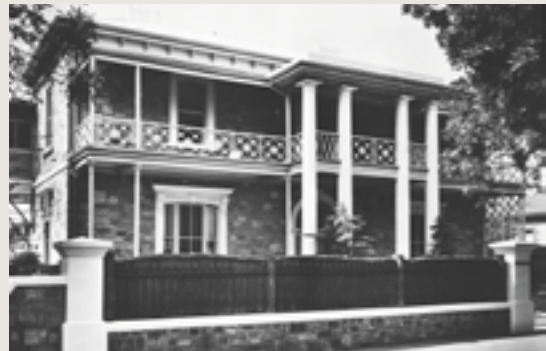
Kumunka Hostel Exterior undated GRG 29/139

No admission records have yet been located.