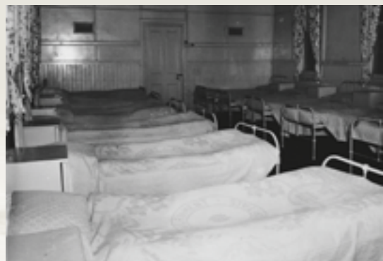
Glandore Industrial School Exterior 1950's, Glandore Dining Room, Glandore Dormitory GRG 23/139, Courtesy State Records of South Australia