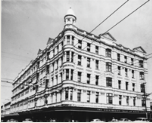
Children's Welfare and Public Relief Department Offices, 169 Rundle St Adelaide 1958, GRG 29/139