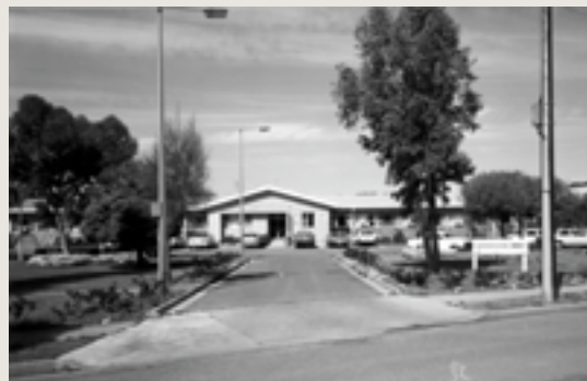
Windana Remand Home - Front Entrance of Southern Cross Homes, Pleasant Ave Glandore, formerly Windana Remand Centre 1989 SLA: B68551

Drawn from 'Annual Reports of the Department of Social Welfare', 1966 & 1970 and 'Annual Reports of the Department of Community Welfare', 1972 & 1975.