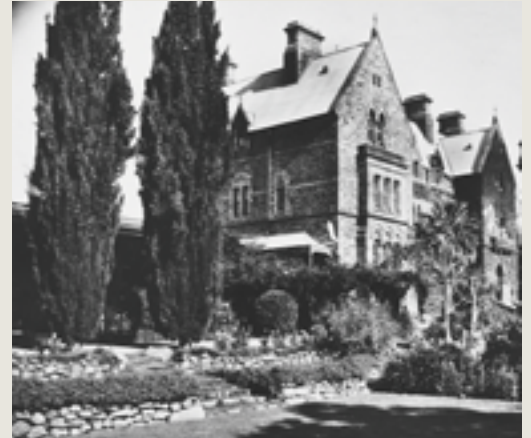
Boys' Reformatory Magill undated, GRG 29/139

From 'Annual Report of the State Children's Council', 1891, p. 8.