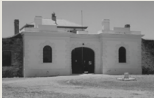
Redruth Girls Reformatory 2005