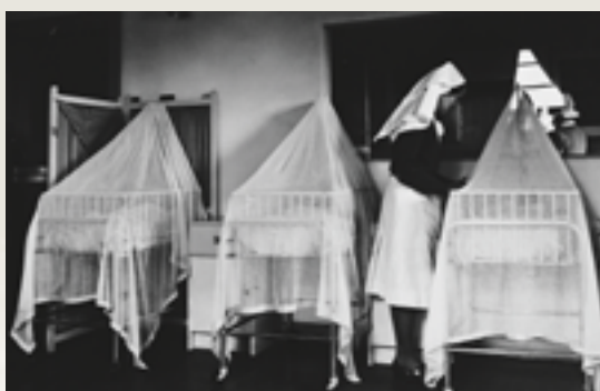
Seaforth Home Boys Dormitory, Seaforth Home Entrance 1946, Seaforth Home Nursery 1950's GRG 29/139, Courtesy State Records of South Australia