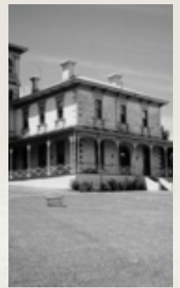
Struan Farm School aerial photo 1947, Boys Dormitory and Entrance Hall GRG 29/139; Struan House 2005